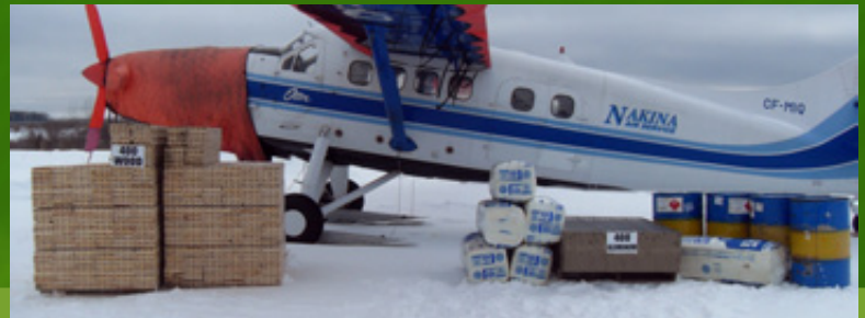
400 Wood Trays in transport